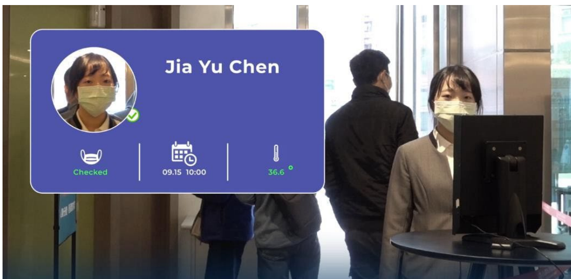
The AI Screen Station performs facial recognition for staff and checks for mask-wearing and body temperature.

The wall- or desk-mounted system performs face recognition for staff as well as guests and visitors