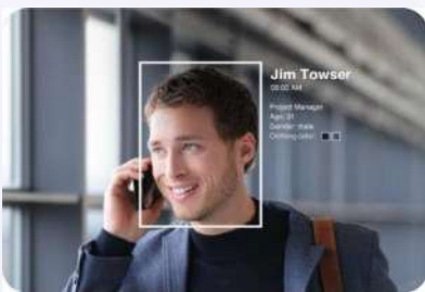
People / Face Recognition