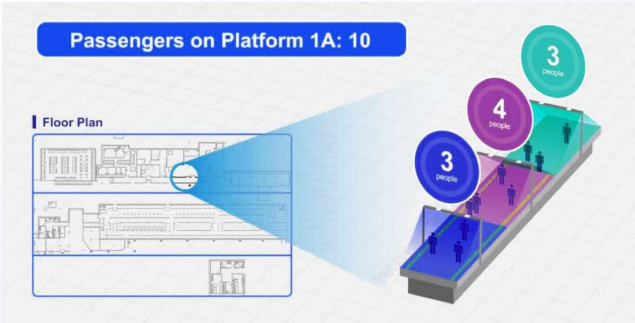
Figure: TRA stations use multiple intelligent analytics to increase customer satisfaction and safety.

Gorilla IVAR eliminated the need to hire additional security staff because the technology could monitor entire areas with real-time alerts into potential threats. This helped to reduce manual checks and ultimately reduced operational costs, while also adding to customer satisfaction.