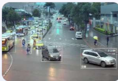
Vehicle Detection / Recognition