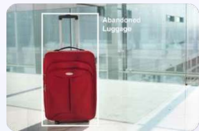
Object Detection / Classification